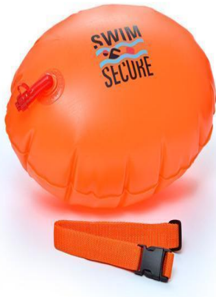
Basic Tow Float